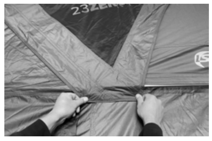
Set up Complete